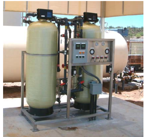
Use of E33 media in typical Modular and APU system installations.